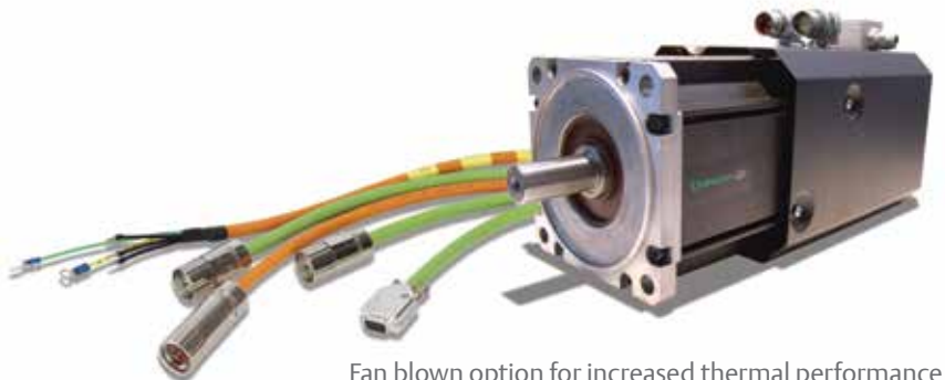
Fan blown option for increased thermal performance