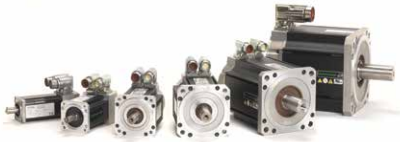
The Unimotor hd family ranges from 55 mm to 190 mm

Unimotor hd has a high power to weight ratio, meaning that it can be easily integrated into the smallest, most demanding applications such as industrial robotics, pick & place and packaging.